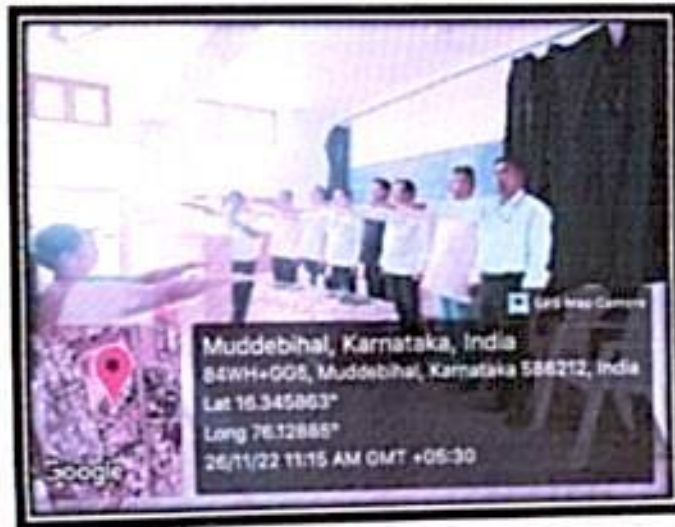
Muddebihal, Karnataka, India 84WH+005, Muddebihal, Karnataka 586212, India Lat 16.345865° Long 76.128891° 26/11/22 11:15 AM GMT +05:30