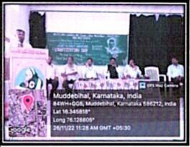
Muddebihal, Karnataka, India 84WH+GG5, Muddebihal, Karnataka 586212, India Lat 16.345818° Long 76.128805° 26/11/22 11:28 AM GMT +05:30