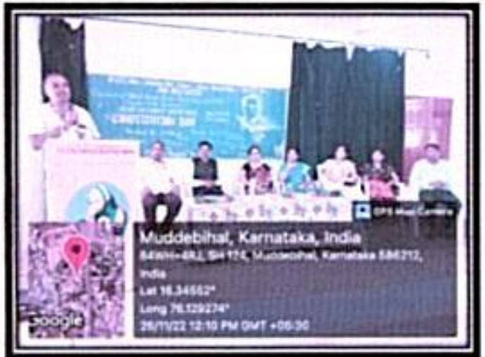
Muddebihal, Karnataka, India 84WH+005, Muddebihal, Karnataka 586212, India Lat 16.345865° Long 76.128891° 26/11/22 12:10 PM GMT +05:30