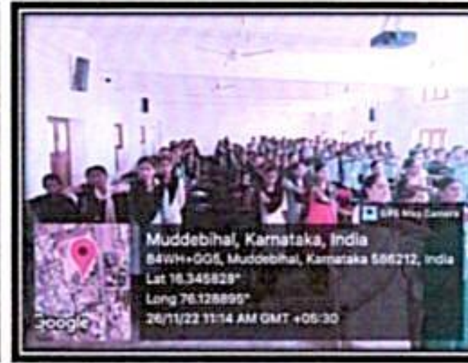
Muddebihal, Karnataka, India 84WH+GG5, Muddebihal, Karnataka 586212, India Lat 16.345829° Long 76.128895° 26/11/22 11:14 AM GMT +05:30