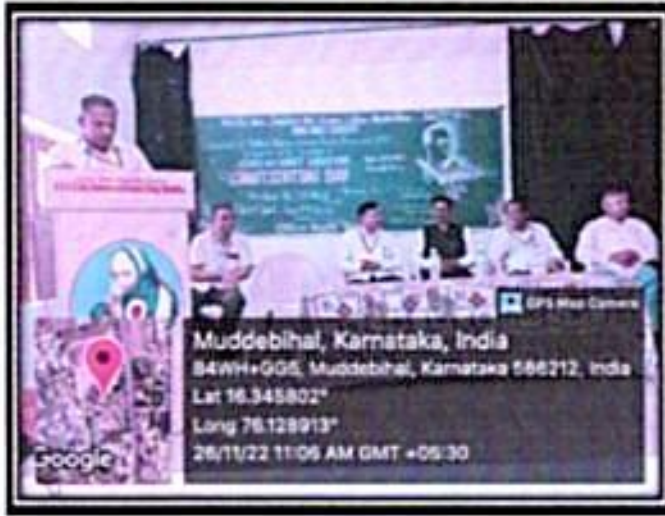
Muddebihal, Karnataka, India 84WH+GG5, Muddebihal, Karnataka 586212, India Lat 16.345802° Long 76.128913° 26/11/22 11:06 AM GMT +05:30