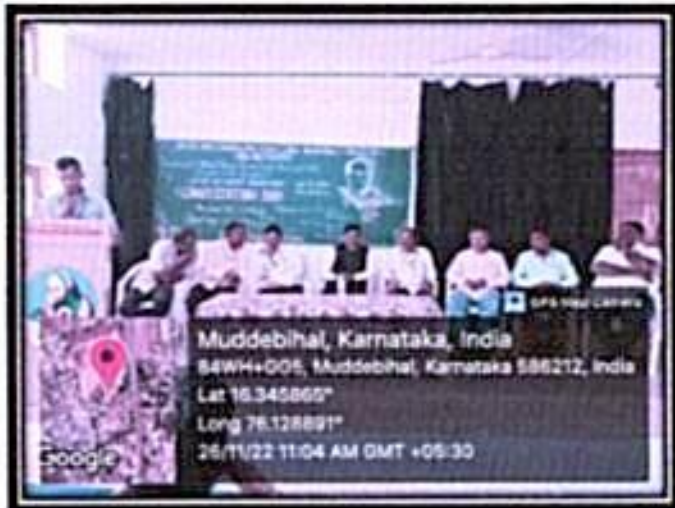
Muddebihal, Karnataka, India 84WH+005, Muddebihal, Karnataka 586212, India Lat 16.345865° Long 76.128891° 26/11/22 11:04 AM GMT +05:30