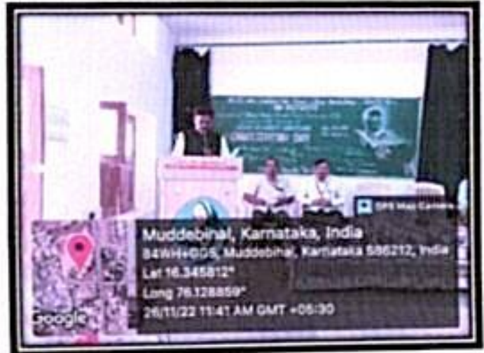
Muddebihal, Karnataka, India 84WH+005, Muddebihal, Karnataka 586212, India Lat 16.345812° Long 76.128859° 26/11/22 11:41 AM GMT +05:30

ಮುಖ್ಯಸ್ಥರು, ಶಾಸ್ತ್ರೀಯ ವಿಭಾಗ ಎಂ. ಬಿ. ವಿ. ಸಿ. ಕಾಲೇಜು, ಮುದ್ದೇಬಿಹಾಳ - 586212.